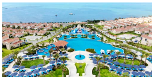
Centara Mirage Resort Mui Ne - NovaHills Mui Ne