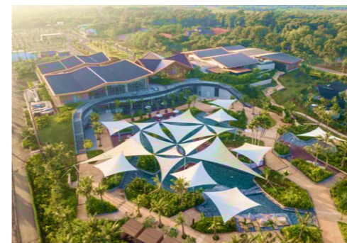
Binh Chau Hot Spring