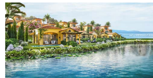
Perspective of NovaBeach Cam Ranh Resort & Villas