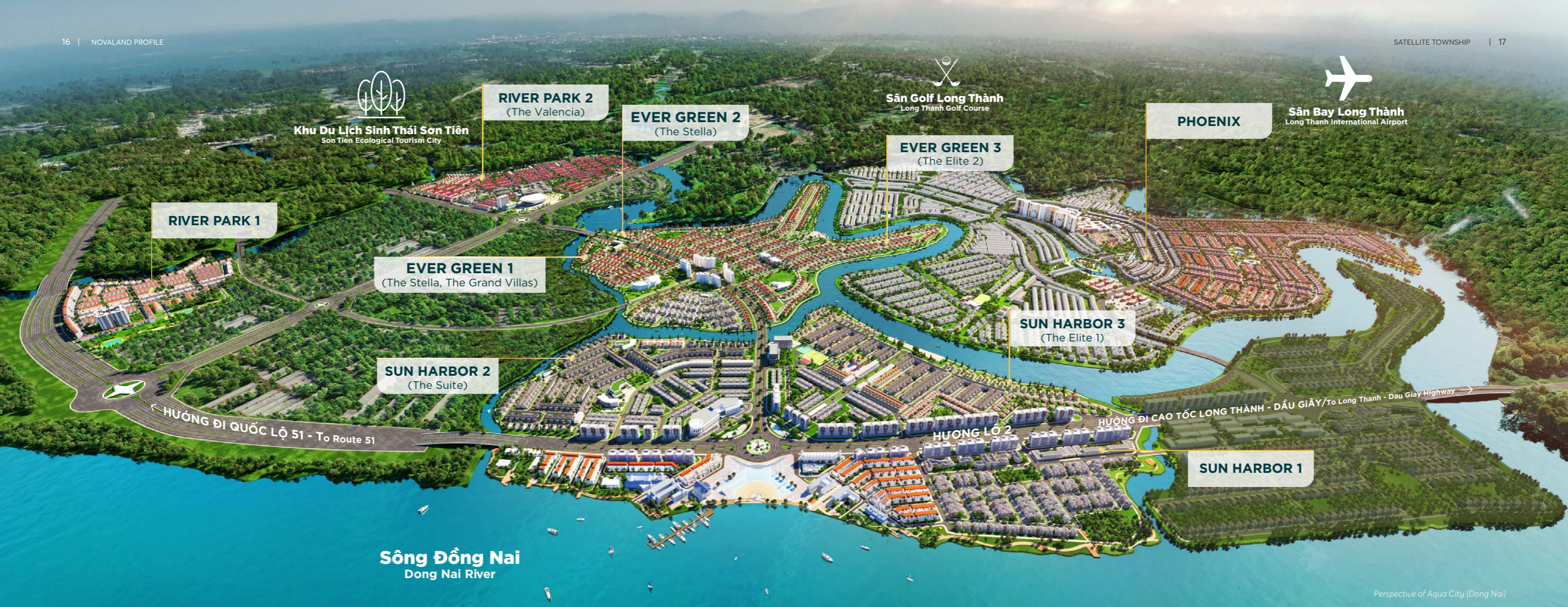
Perspective of Aqua City (Dong Nai)