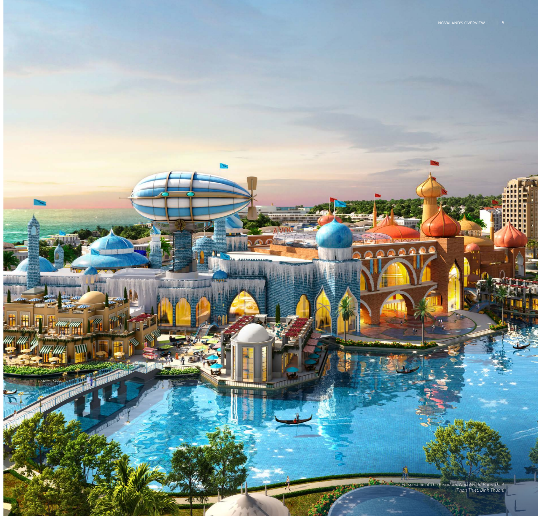
Perspective of The Kingdom, NovaWorld Phan Thiet (Phan Thiet, Binh Thuan)