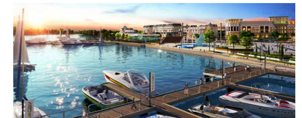
Perspective of Aqua Marina - the complex of square