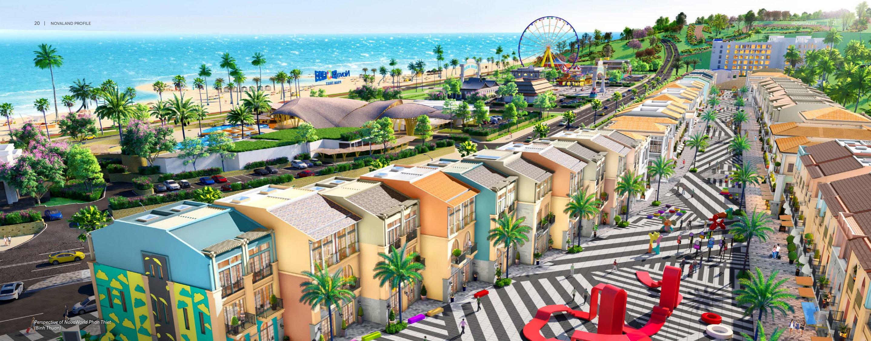
Perspective of NovaWorld Phan Thiet (Binh Thuan)