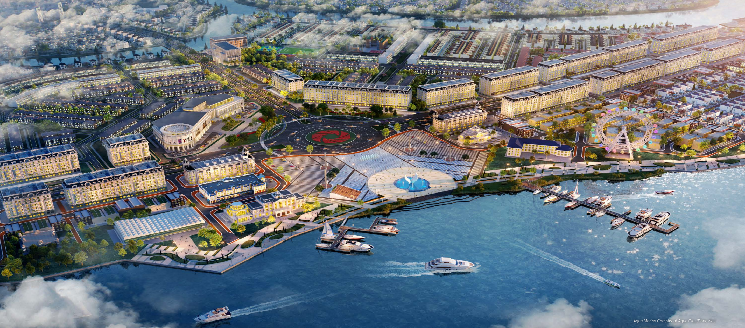
Aqua Marina Complex at Aqua City (Dong Nai)