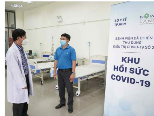
Novaland constructed and handed over the Covid-19 Resuscitation Area of the 2nd Field Hospital in HCMC

Pioneering sustainable development activities with the community and promoting corporate social responsibility has been a cultural beauty enlightened since the early days of the Novaland's establishment. Novaland's social programs focus on four main areas: Education, Health, Social Security, and Community Development.