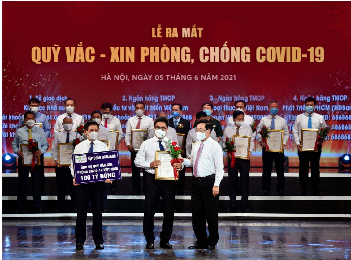
Novaland donated 100 billion VND to the Covid 19 Vaccine fund

With the vision of "Being the leading real estate developer in Vietnam in Residential & Commercial, Hospitality, Industrial" we are committed to doing business responsibly and implementing a sustainable development strategy in alignment with the 17 Sustainable Development Goals of the United Nations, as well as continuously updating international practices and trends in the fields of environment, society and governance.