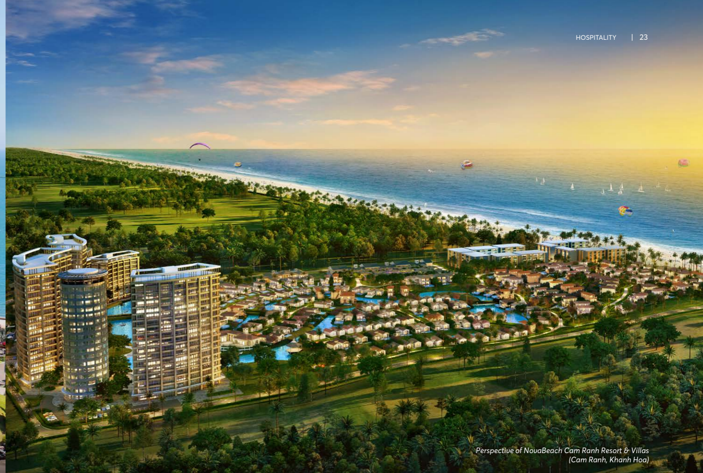
Perspective of NovaBeach Cam Ranh Resort & Villas (Cam Ranh, Khanh Hoa)