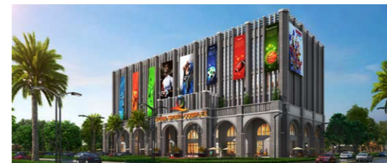
Perspective of Aqua Sport Complex - the multi-purpose sports hall