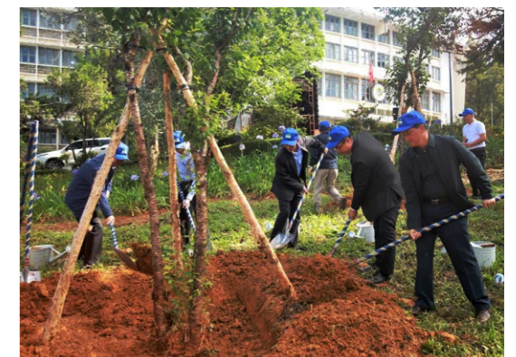
Novaland accompanied Lam Dong Province to achieve the goal of planting 50 million trees in project "Green Up Vietnam - Million trees" for a brighter life.