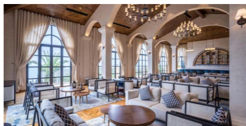
Centara Mirage Resort Mui Ne has been in operation since July 2021

Possessing the advantage of natural hilly terrain and a seafront landscape, Centara Mirage Resort Mui Ne has more than 600 detached villas that are adjacent to the mountain with sea views and designed in a Spanish Mediterranean style with high-range internal facilities, such as a central pool cluster, a 250-meter-long swimming pool, a 1,000-seat event center, a sea sports club, international restaurants, a high-quality spa system, and an observation tower that is over 100 meters high.