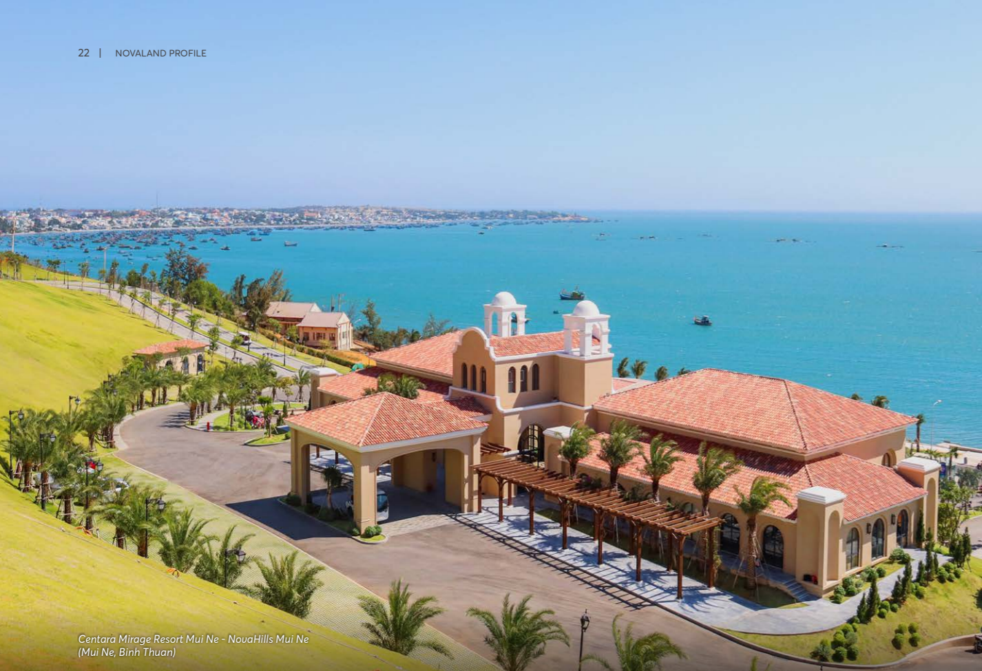
Centara Mirage Resort Mui Ne - NovaHills Mui Ne (Mui Ne, Binh Thuan)