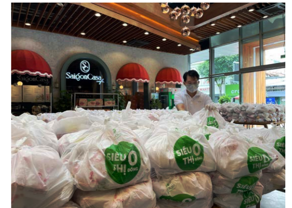
Novaland joined hands to help community overcome the Covid-19 pandemic, deploying a "0-Dong Supermarket"