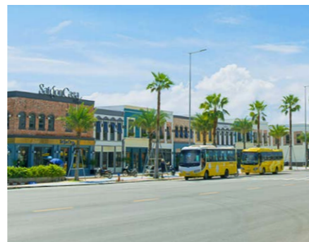
The seafront Shophouses at The Tropicana

NovaWorld Ho Tram is a high-class entertainment and leisure complex with the large-scale of nearly 1,000 hectares, stretching along the 30 kilometers coastal line from Loc An to Binh Chau, only taking 90 minutes from Ho Chi Minh City and 60 minutes from Long Thanh International Airport. NovaWorld Ho Tram is divided into ten divisions that take advantage of the pristine natural beauty and nearby forest terrain, creating favorable conditions for the development of valuable Second home products and high-class utility chains, bringing international experience to the tropical city of Ho Tram.