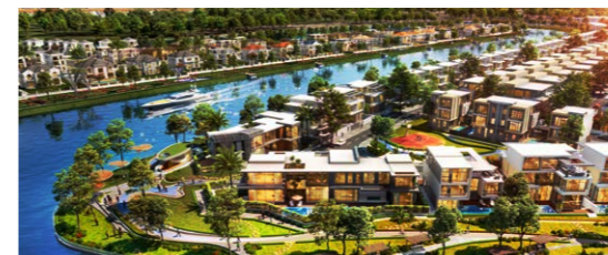
Perspective of a riverside villa corner at Phoenix Island