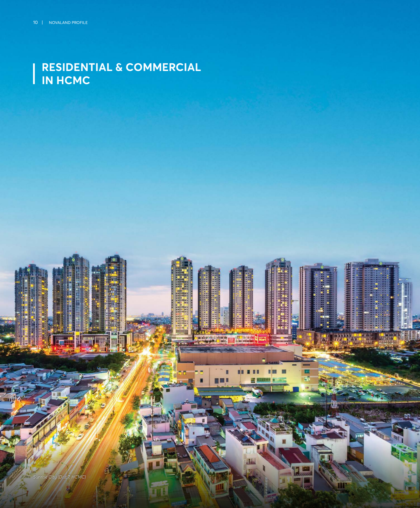
Sunrise City (Dist.7, HCMC)