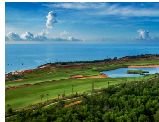
The living space at PGA Golf Villas is covered with green space and a 360-degree view of the exclusive PGA golf course