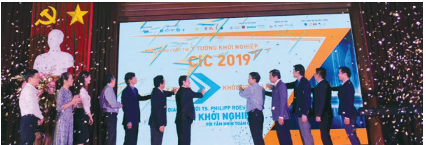
On April 17, 2019, to coincide with the "Creative Idea Contest – CiC 2019" held by the National University HCMC with support from the Department of Science and Technology HCMC, Start-up Fund National University HCMC and QTSC, Novaland Group sponsored VND1 billion for the program. The ceremony to kick off CiC 2019 was held in the Software Technology zone at National University HCMC with an aim to attract over 200 ideas and projects from start-ups to encourage creative and innovative ideas in the community of students and lecturers in universities.