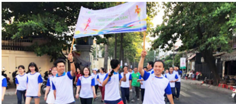
Novaland staff responds to "Olympic running day for the sake of residents' health 2019" in District 3 HCMC (March 2019)