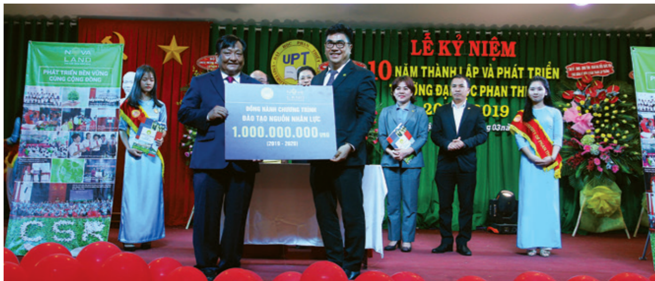
Representative of Novaland Group offered a scholarship package of VND1 billion to representative of Phan Thiet University

On this occasion, Novaland offered a scholarship package of VND1 billion to students with good academic results in the 2019-2020 school year and simultaneously committed to providing opportunities to new graduates to work at Novaland projects in Binh Thuan Province.