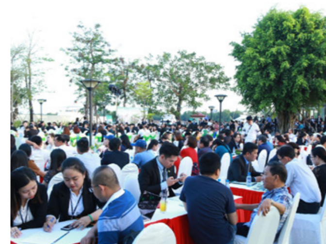
There is no empty space at NovaHills Mui Ne introduction event