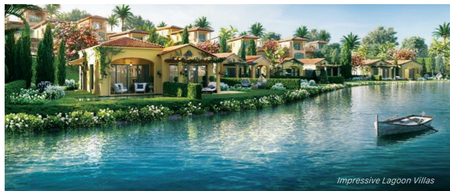
Impressive Lagoon Villas

NOVALAND OFFICIALLY PARTICIPATES IN PROMISING HOSPITALITY AND RESORT REAL ESTATE MARKET IN CAM RANH, KHANH HOA WITH NOVABEACH CAM RANH RESORT & VILLAS PROJECT WITH A SCALE OF AROUND 23HA.