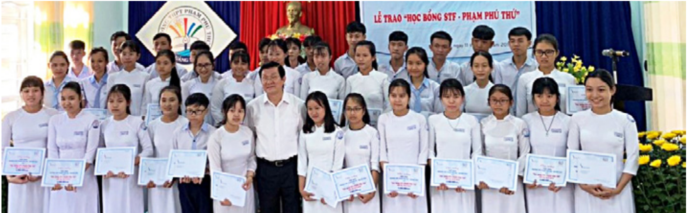
Frequently sponsoring the STF-Pham Phu Thu scholarship of Saigon Times, offering scholarships to studious pupils in Quang Nam Province (February 2019)