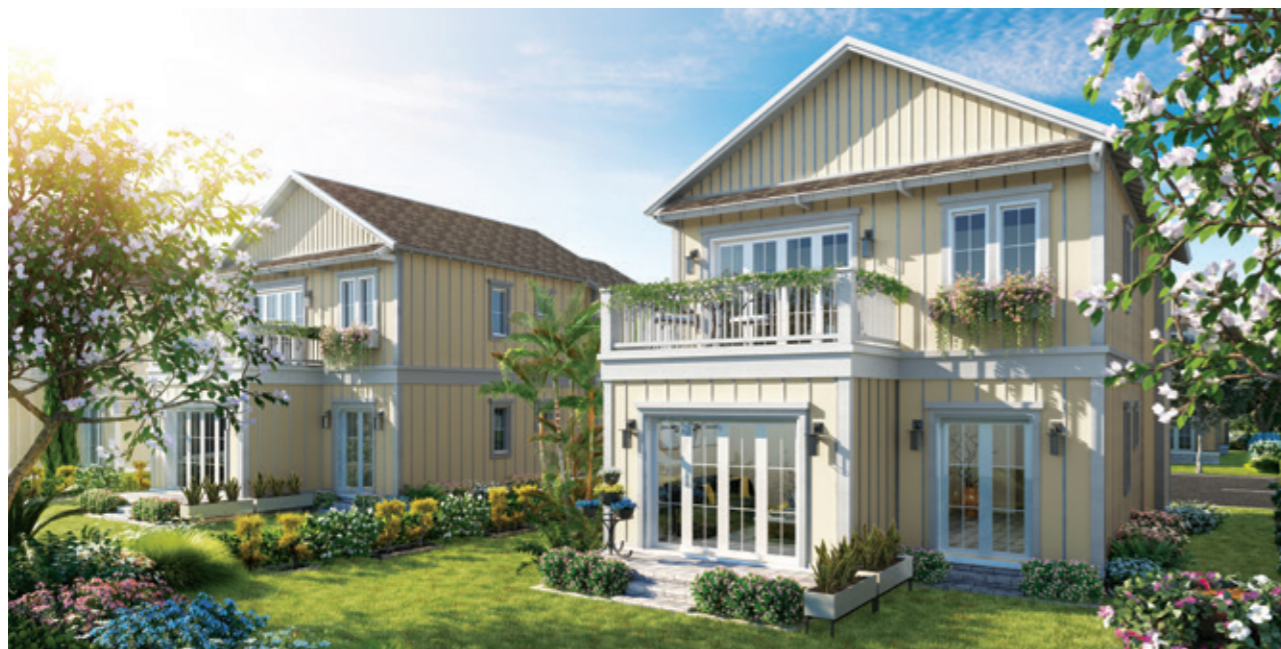
The perspective of second home - NovaWorld Phan Thiet

NovaWorld Phan Thiet features a diverse range of investment opportunities, including townhouses, second homes and shophouses with a sea view. The project will also introduce The Florida – Ocean City, with an impressive American style. Villas and townhouses range from 100m 2 to 144m 2 , with prices from VND3.3 billion.