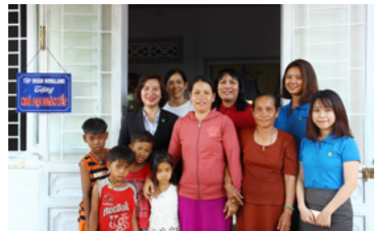
Cooperate with the Fatherland Front Committee of Binh Thuan Province to hand over a great unity house to ethnic minority groups in Binh Thuan (March 2019)